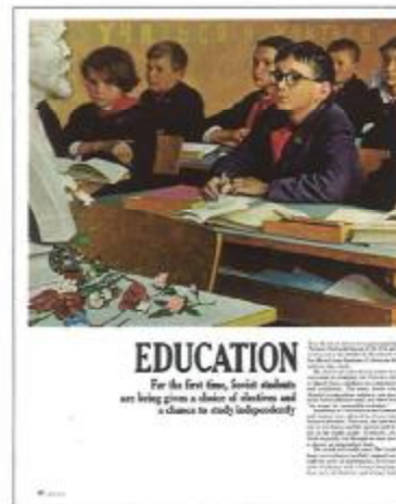
FIGURE 3. First page of a two-page Look magazine article with Rockwell's illustration.

Louis FBI case agent saying that the Rockwell art theft case was still open (a tip probably generated from publicity about the newly-formed Team). Information that later came out at trial (see below), including signed memos in the FBI's own files, suggest that the case should have been closed in 1988, but, mysteriously, was not. Wittman “had no knowledge of these 1988 documents.” Had the Art Crime Team known about this information in 2004, he told IFAR, “we never would have proceeded.”