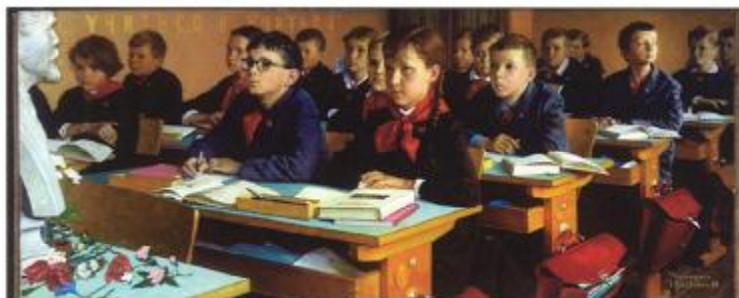
FIGURE 1. NORMAN ROCKWELL. Russian Schoolroom, 1967. Oil on canvas. 15 ¼" x 37".

It all led to a bench trial this March in the U.S. District Court